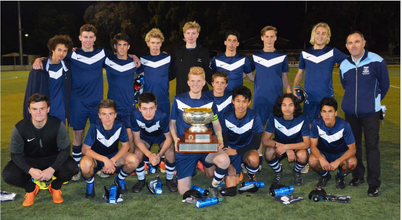
Merewether High School – 2017 Boys Puma Cup Champions