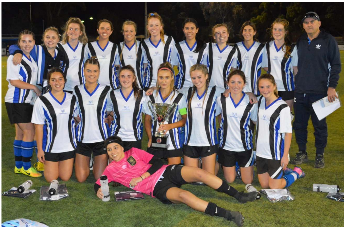
Woolooware High School - 2017 Girls High Schools KO Champions