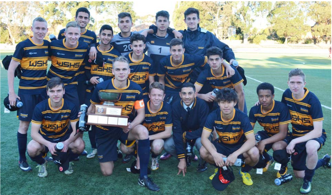
Westfields Sports High School – 2017 Boys Puma Sports High Schools Champions