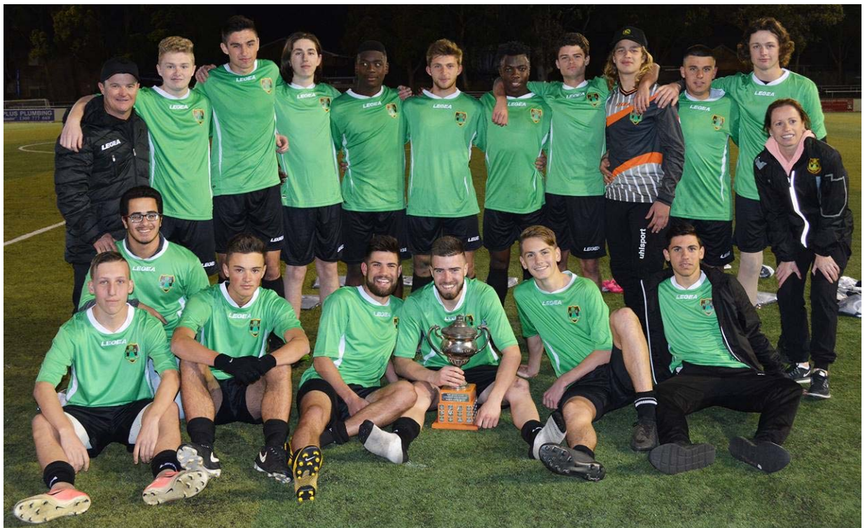
Wollongong Performing Arts High School - 2018 Boys High Schools KO Champions