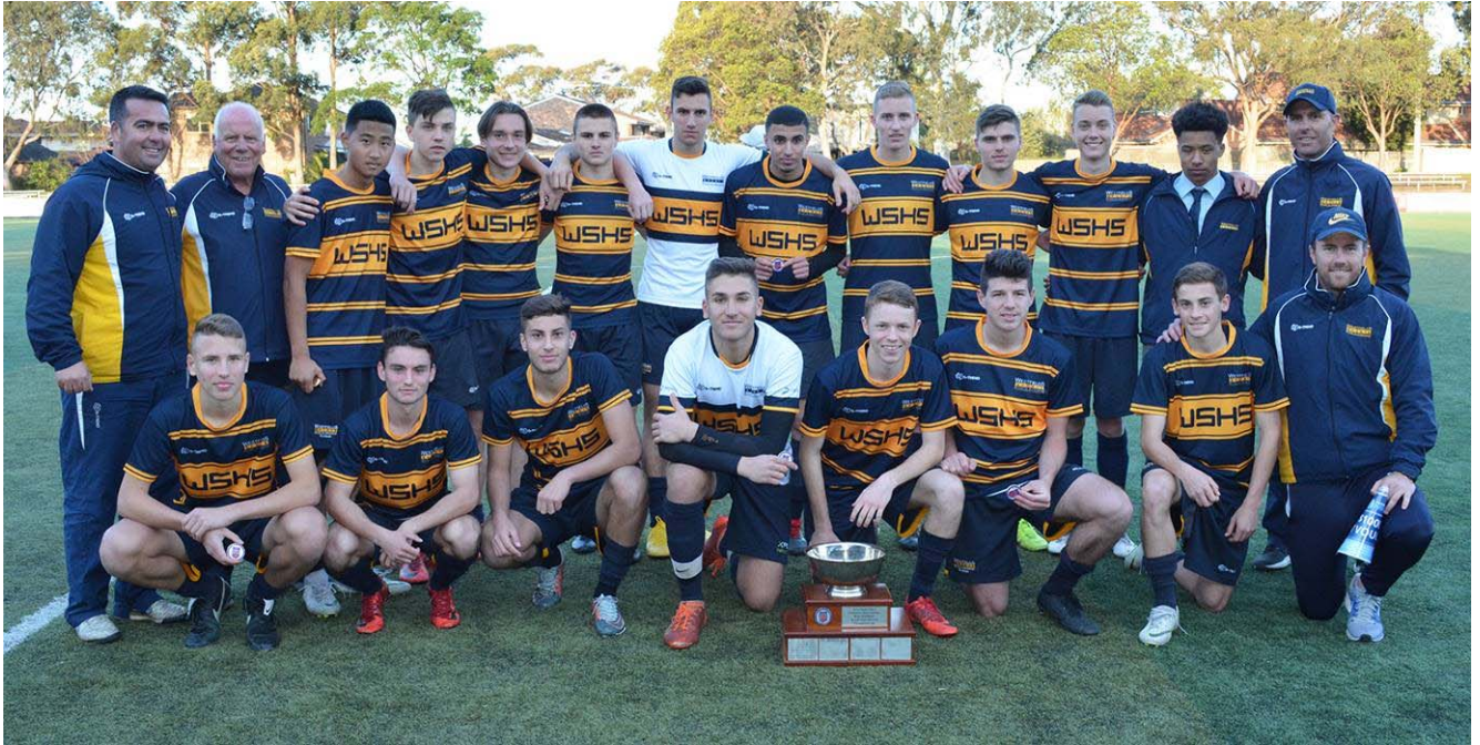
Westfields Sports High School – 2018 Boys Puma Sports High Schools Champions