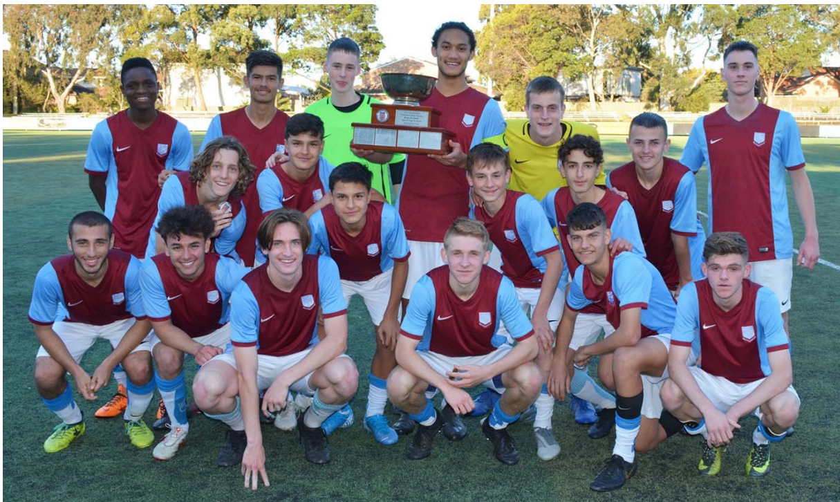
The Hills Sports High School – 2019 Boys Puma Sports High Schools Champions