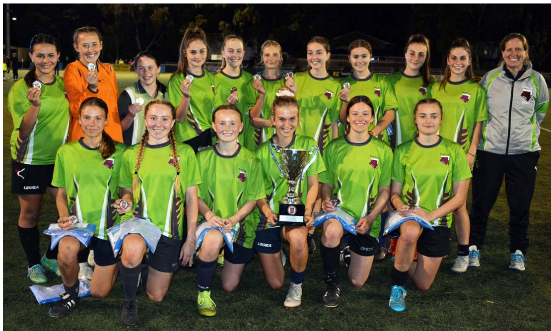
Rouse Hill High School - 2019 Girls High Schools KO Champions