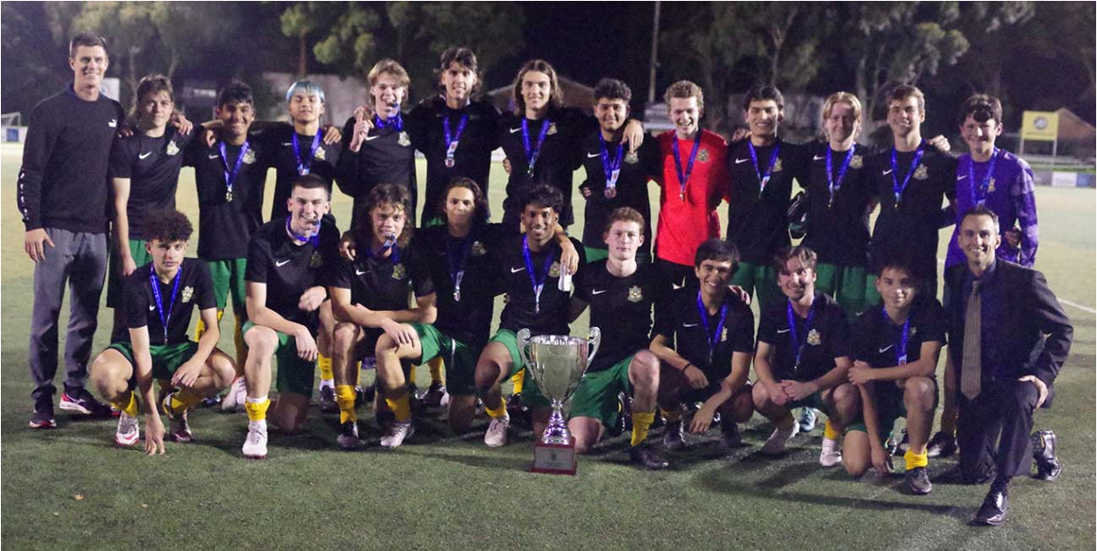
Epping Boys High School – 2022 Boys Puma Cup Champions