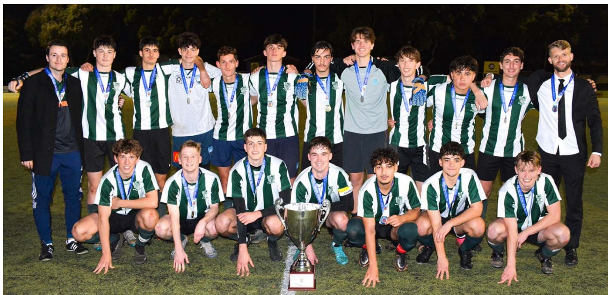
Caringbah High School – 2023 Boys Puma Cup Champions