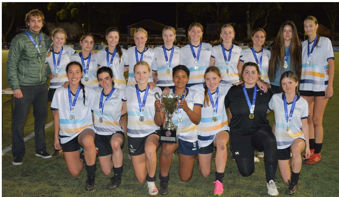
NBSC Freshwater - 2023 Girls Puma Shield KO Champions